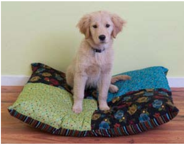
26" x 34"