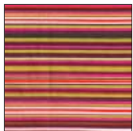
A - Cut (1) 5-1/2" square of each print

With names like Lava Light and Dumb Dots in their Spice collection, Michael Miller continues to delight us with retro patterns and hot color combinations such as clementine and the super-trendy shade du jour: rich brown, www.michaelmillerfabrics.com