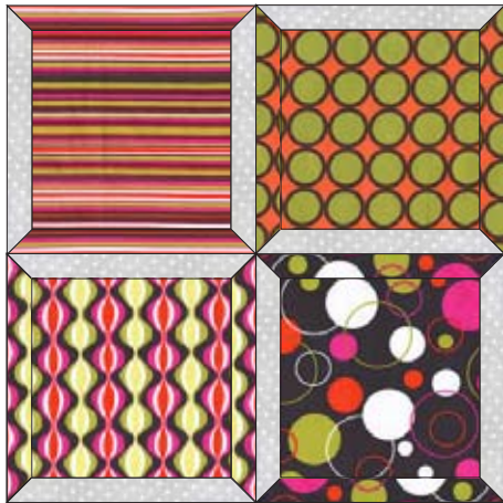
Fabrics: CX4253 (Hoopla Dot); CX4305 (Ring Dot); CX4376 (Lava Light); CX3137 (Play Stripe); Clip Dot (white)

PLEASE NOTE: This fabric stash block first appeared in the Feb/Mar 2010 issue of QUILT Magazine. Many fabrics have a shelf life of about 6 months to 1 year. These exact fabrics may not still be available for purchase. Take heart! Your favorite quilt shop can help you select suitable substitutes in colors and patterns that will work just as well to make this block.