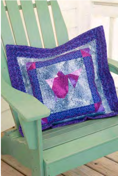
24" square, including flange

Web Bonus project for Hot Days, Cool Bag featured in Quick Quilts, Issue #102, Summer 2009