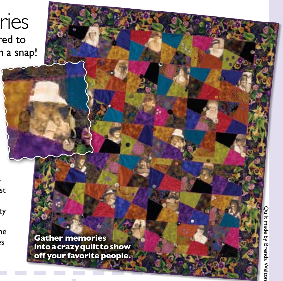
Gather memories into a crazy quilt to show off your favorite people.

The newest printable fabric sheets are quick and easy to use! The fabric is backed with plastic, so it feeds through an inkjet printer just like paper. The fabric is pretreated to produce the highest photo-quality image — many brands don't even need ironing or chemical setting. The process only takes about 30 minutes and the steps are easy.