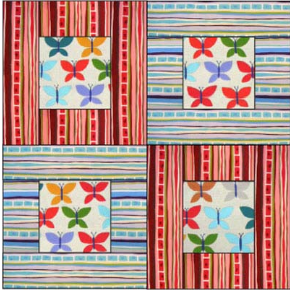
Fabrics: 6903A (red stripe); 6903B (blue stripe); 7031B (butterflies)

PLEASE NOTE: This fabric stash block first appeared in the Oct/Nov 2009 issue of QUILT Magazine. Many fabrics have a shelf life of about 6 months to 1 year. These exact fabrics may not still be available for purchase. Take heart! Your favorite quilt shop can help you select suitable substitutes in colors and patterns that will work just as well to make this block.