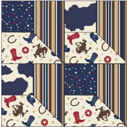
Fabric: C8503 (blue stripe); C8505 (blue star); C8501 (cream rodeo); C8509 (blue cowhide)

PLEASE NOTE: This fabric stash block first appeared in the Oct/Nov 2009 issue of QUILT Magazine. Many fabrics have a shelf life of about 6 months to 1 year. These exact fabrics may not still be available for purchase. Take heart! Your favorite quilt shop can help you select suitable substitutes in colors and patterns that will work just as well to make this block.