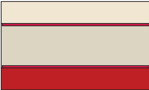
Joining the panels

Sew the word print strip to the top of the fairy tale strip, then sew the red dot strip to the bottom of the fairy tale strip, catching the binding in the seam. Press the seams open and press the bindings toward the center strip to make the pillow cover.