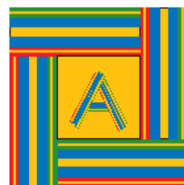
Partial seam square