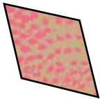
B - Cut (4) of Template B