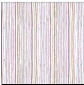
A - Cut (4) 6-1/2" squares

The Painted Daisy is an intermediate skill level block that changes dramatically with color placement. Graphic petal prints on a colorful stripe background make a thoroughly modern effect. If you want to flip from traditional to hip, the Graffiti Chique collection by Paris Bebe Fabrics, www.parisbebe.com , makes it a snap!