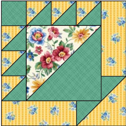
Victory Garden collection by Eleanor Burns for Benaertex, www.benartex.com

PLEASE NOTE: This fabric stash block first appeared in the Feb/Mar 2009 issue of QUILT Magazine. Many fabrics have a shelf life of about 6 months to 1 year. These exact fabrics may not still be available for purchase. Take heart! Your favorite quilt shop can help you select suitable substitutes in colors and patterns that will work just as well to make this block.