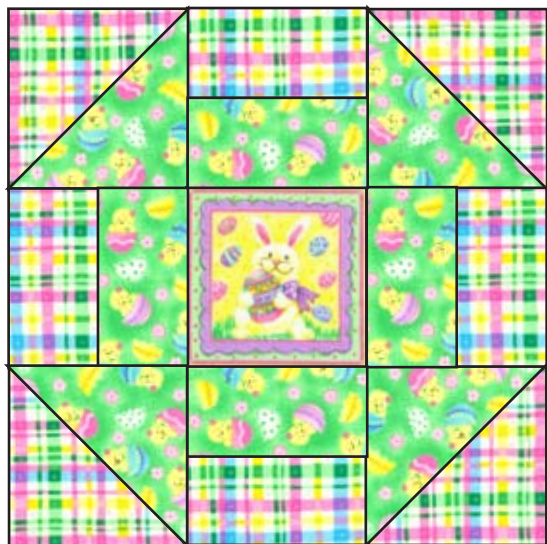
Spring Tidings collection by Fabri-Quilt, Inc., www.fabri-quilt.com

PLEASE NOTE: This fabric stash block first appeared in the Feb/Mar 2009 issue of QUILT Magazine. Many fabrics have a shelf life of about 6 months to 1 year. These exact fabrics may not still be available for purchase. Take heart! Your favorite quilt shop can help you select suitable substitutes in colors and patterns that will work just as well to make this block.