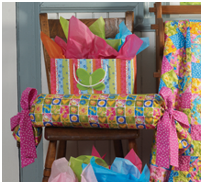
(18" length; 7" diameter)

Web Bonus pattern for pillow roll by Ann Baxter from the Butterflies & Flowers collection and Polka Dots collection by Camelot Cottons, www.camelotcottons.com )